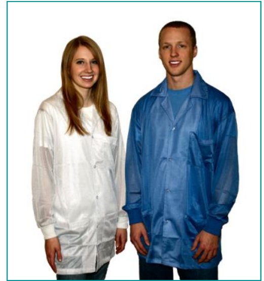
Model: JKC 8801– JKC8810 Collared ESD Jackets Extra Small - 6XL