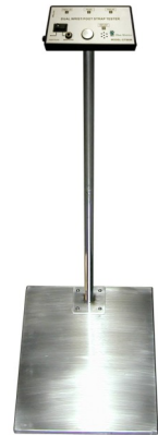
Model GTS600 K: Tester and Foot Plate