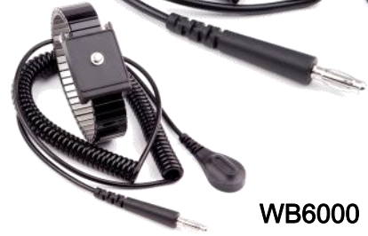
WB6000 With CC9037