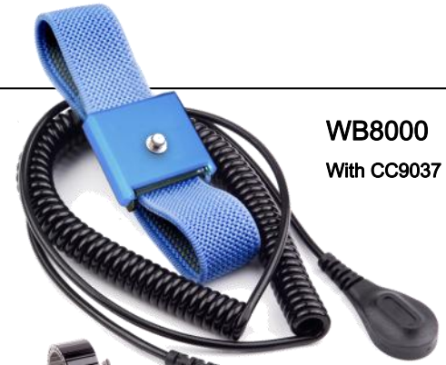
WB8000 With CC9037

Transforming Technologies carries a wide range of adjustable wrist bands and coil cord sets. Our wrist straps sets will ensure that static sensitive materials are protected during handling. Our Coil Cords are versatile enough to fit most all industry standard banana jacks and wrist straps. These coil cords come in 6' or 12' lengths and 3 snap sizes: 4mm, 7mm, and 10mm and are available with swivel or right angle banana plug.