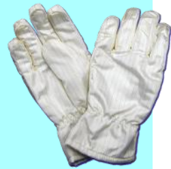
FG Series Gloves

The FG series Nomex® gloves are designed for processes that require handling objects at elevated temperatures without compromising cleanliness or potential damage to static discharge.